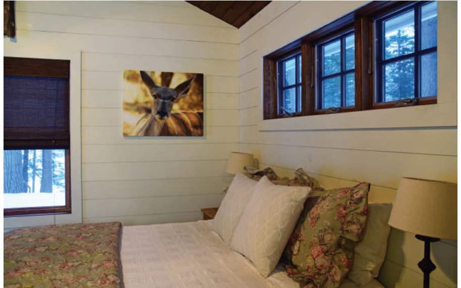
The master bedroom of the home on Lake Eden built by Cole Contracting in north central Vermont.

At the end of a half-mile switchback driveway, the house gives first impressions of warmth and relaxation, even in the middle of a northern Vermont winter. The layout features an open design with plenty of width and depth, but also verticality. The kitchen, living and dining rooms are all open to each other with a wall of windows reaching for the 26-foot ceilings, and the inviting view of Lake Eden to tie them all together. Douglas Fir plank-style stairs access the upstairs loft, which spans half the width of the house and shares the lake view with the main floor. The master bedroom and bath, second and third bedrooms and a second bathroom sit on