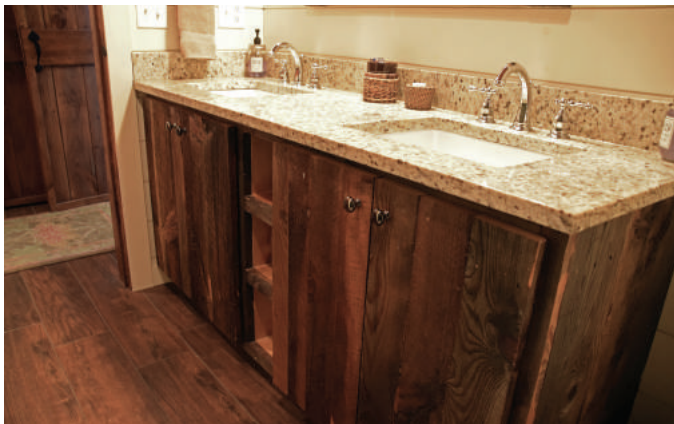
The master bath suite.