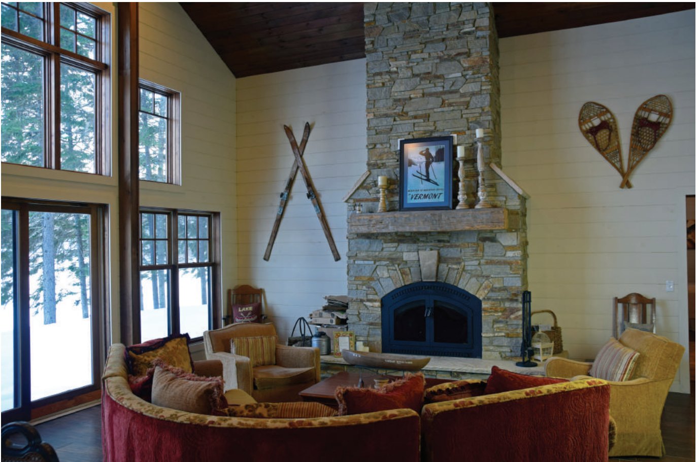
The home's living room.

“It would be a great place for ice fishing, cross country skiing, swimming in the summer, and just contemplating life,” he muses.